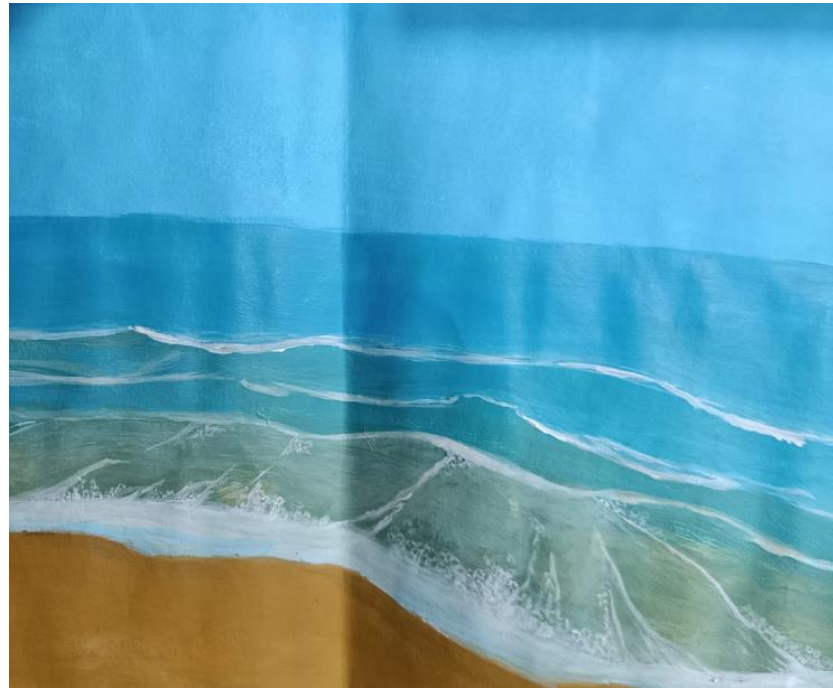
2 nd – Rosa Tong