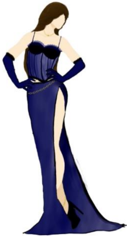
3 rd – Kayleigh Yeo